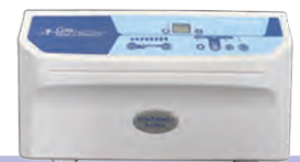
35" Elite Balance Air